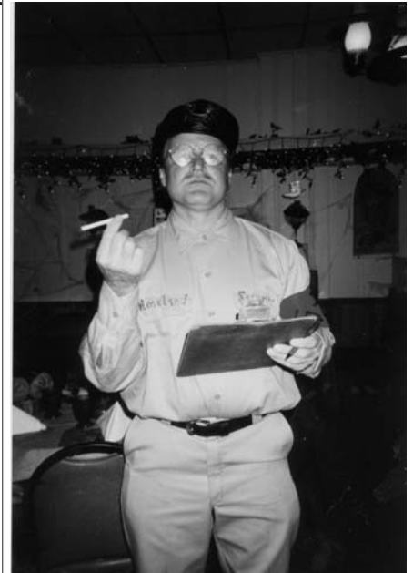
Homeland Security Agent at FVLP Halloween Party